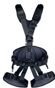
EXPERT 3D STANDARD black