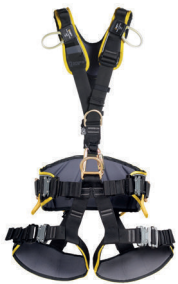
EXPERT 3D SPEED STEEL