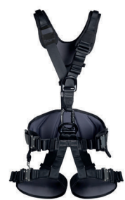
EXPERT 3D SPEED black