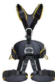
EXPERT 3D STANDARD