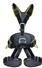
EXPERT 3D SPEED